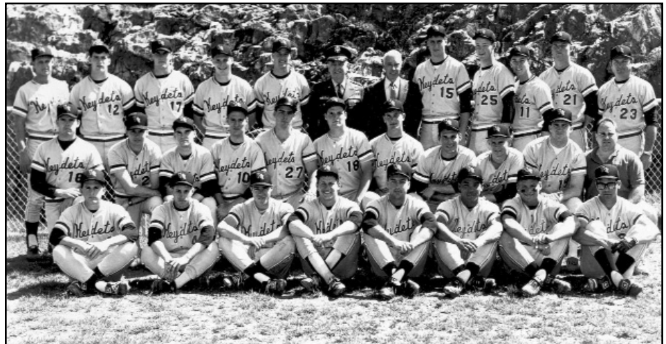
The 1988 Keydet club finished with a 20-20 record, including an 11-7 mark in the Southern Conference on their way to the North Division title. Here they are posed with Hall of Famer Joe Dimaggio.