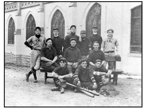
The 1900 VMI Baseball squad