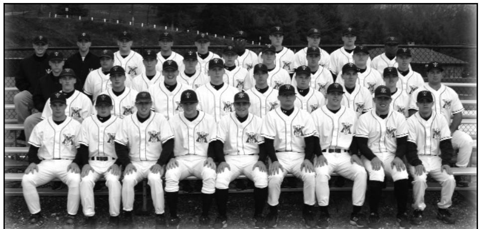
The 2005 Keydets broke the school record for wins in a season with 27 and became the first team to play in the Big South Championship.

%-Denotes Big South Tournament Game- Conway, S.C.